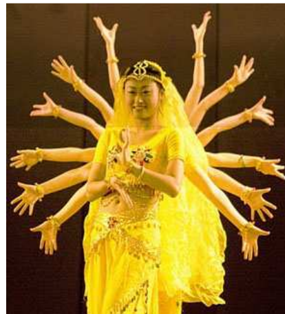
Penn Chinese Dance Group in action.

March 26, Tuesday , enjoy Persian dances performed by the Rangeen Kaman group and stick around to learn around to learn a few moves. 3:45 pm